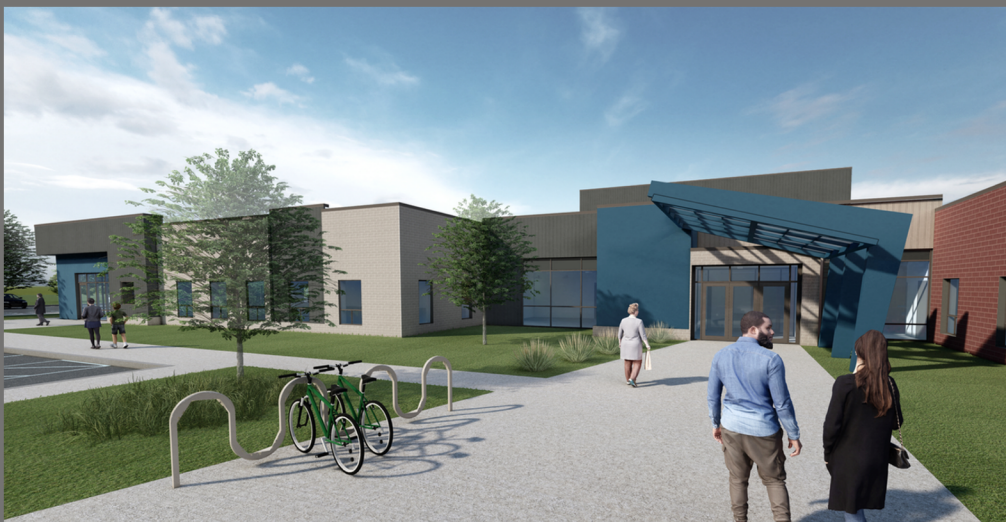
Right: The rear entrance of the Campus, planned for construction in Detroit's Core City neighborhood.