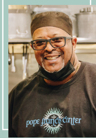
Chef Hollywood Kitchen Manager